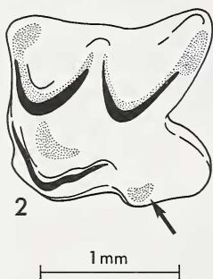
Fig. 2. Left M 1 of S. araneus showing pigmented hypocone (arrow)

This character (Fig. 2) separates S. araneus and S. coronatus from all other species. In young S. araneus and S. coronatus the hypocones on M 1 and (usually) M 2 (and very rarely P 4 as well) were very weakly pigmented (in old animals the teeth are worn, and naturally the pigment on the hypocones is absent), while in all other species (even the related S. granarius ) the hypocones were completely unpigmented.